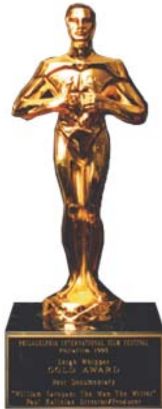
Gold Award For Best Documentary Film Philadelphia International Film Festival 1995